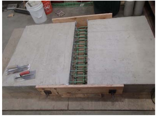
(a) Panels positioned to cast closure pour