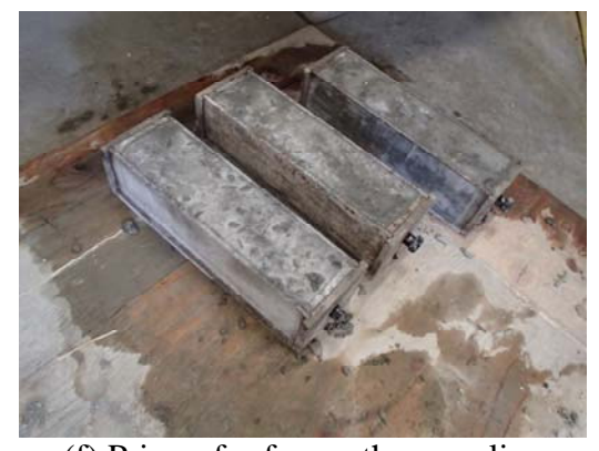
(f) Prisms for freeze-thaw cycling