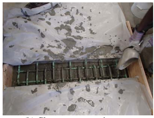
(b) Closure pour casting