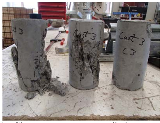
(e) Closure pour concrete cylinder tests